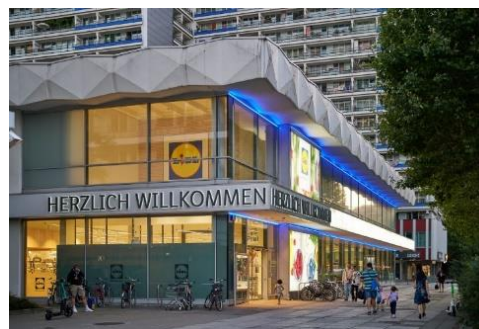
Food retailers Germany