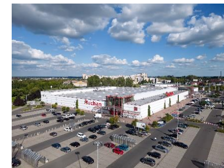
Food retailers Poland